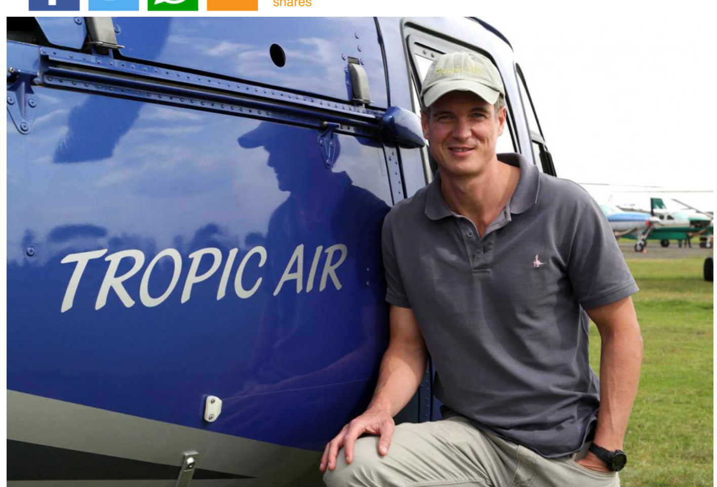
Shot down: Mr Gower was reportedly targeted by elephant poachers Tropic Air Kenya

Three people have reportedly been arrested in Tanzania over